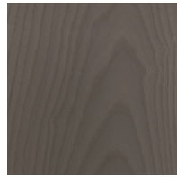
WA-G: White Ash, Grey