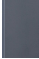
MOC: Matte Opaque Charcoal