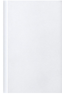
MOW: Matte Opaque White