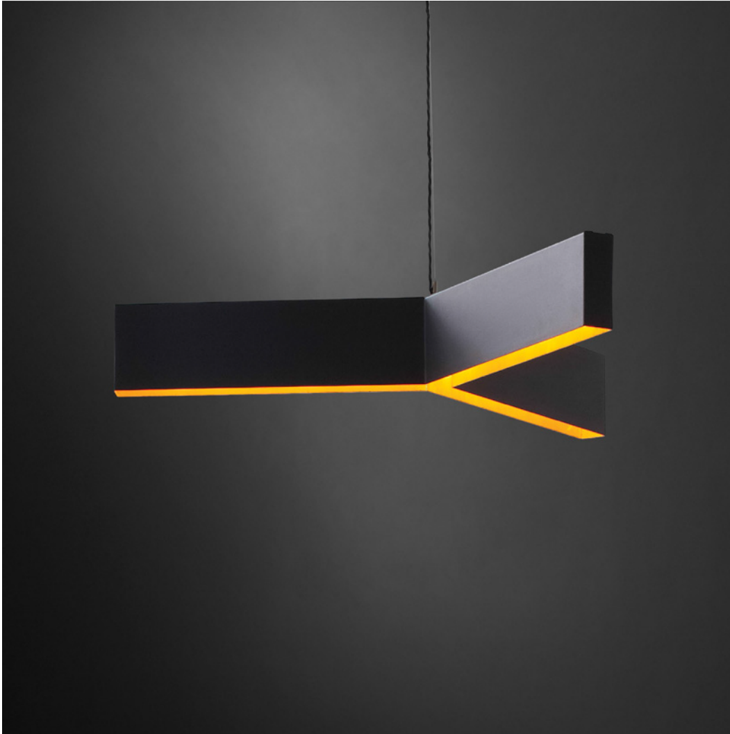
Bucky Pendant by Christopher Boots Contemporary Australia

Inspired by Buckminster Fuller's geodesic Biosphère building in Montreal, Bucky is a striking pendant constructed from blackened steel and gilded in 24-carat gold leaf. Designed to hang in clusters, Bucky is best experienced at night when the subtle slithers of light emerge.