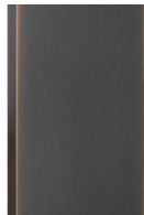
DRB: Dark Rubbed Bronze