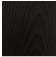
WA-E: White Ash, Ebonized