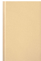
NRB: Natural Rubbed Bronze