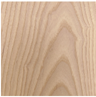
WA-N: White Ash, Natural