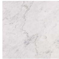
CRM: Carrara Marble