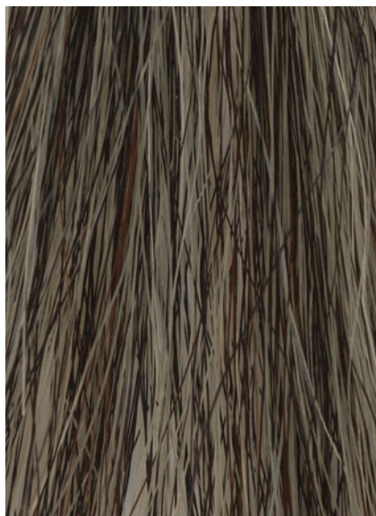
Medium Silver Horsehair