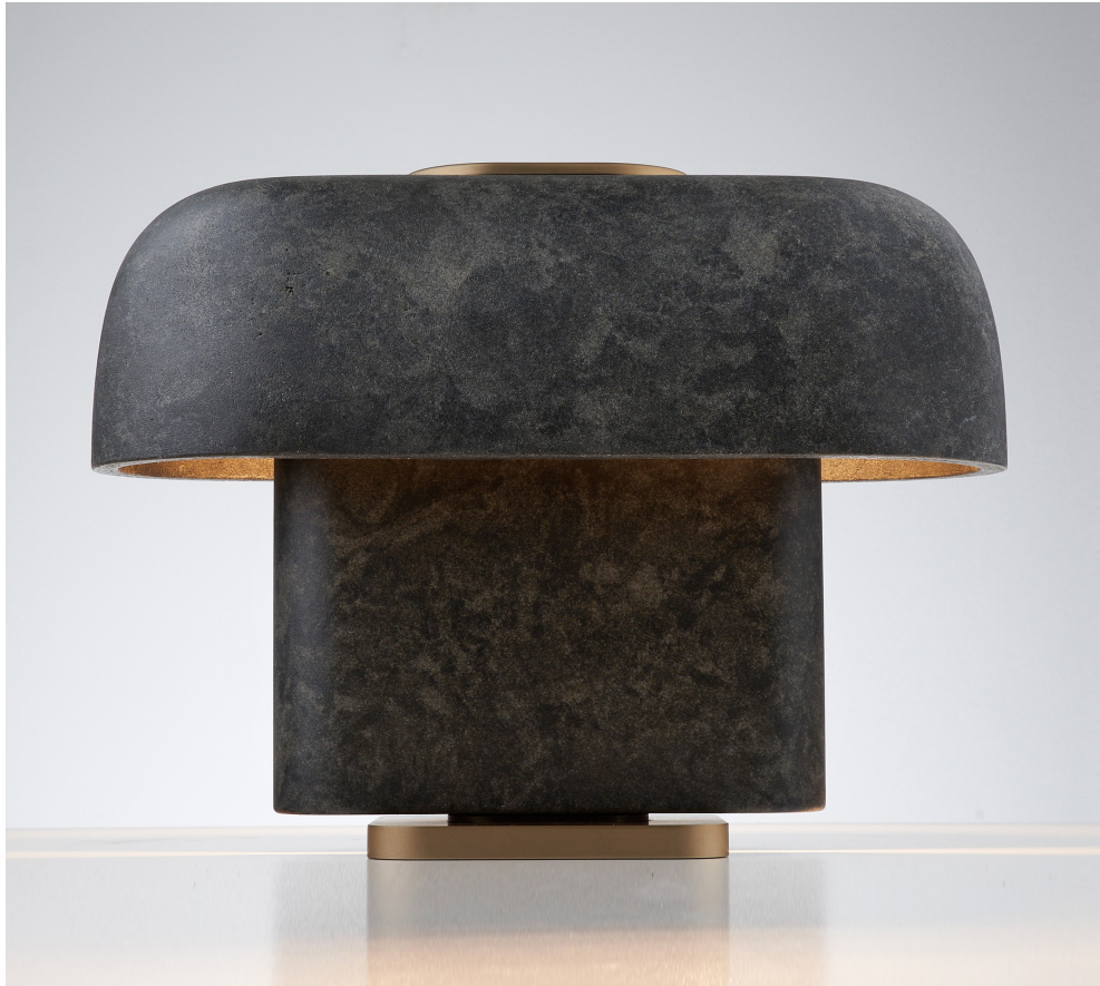
Shown in Trailhead Cast Mineral Shade, Trailhead Cast Mineral Base, and Natural Metal