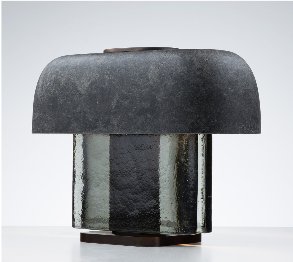
Shown in Trailhead Cast Mineral Shade, Shale Cast Glass Lamp Base, and Otter Metal