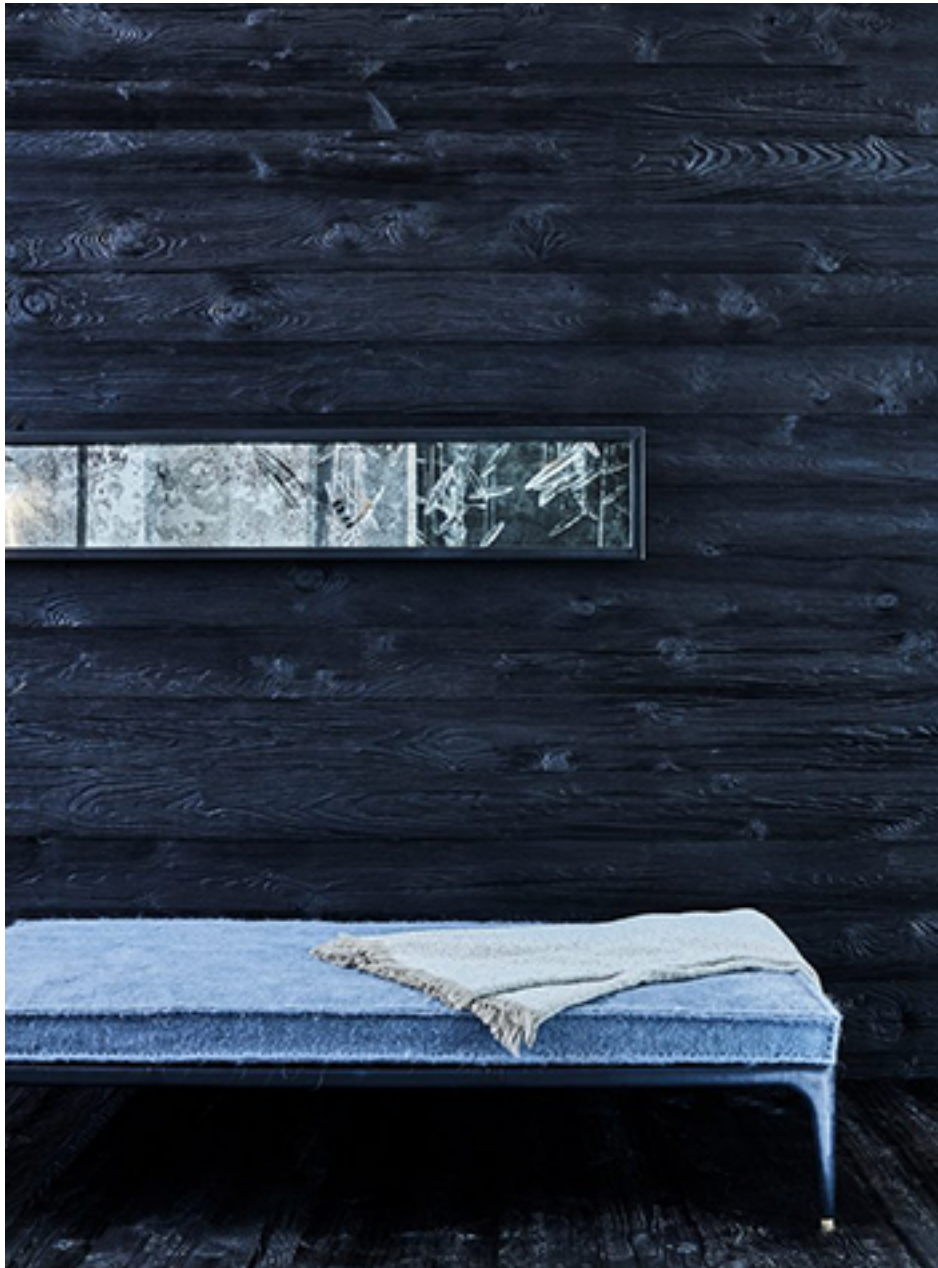
Mayfair Mirror by Ochre Contemporary United States

Gesso and burnished bole frame with mercury glass mirror.