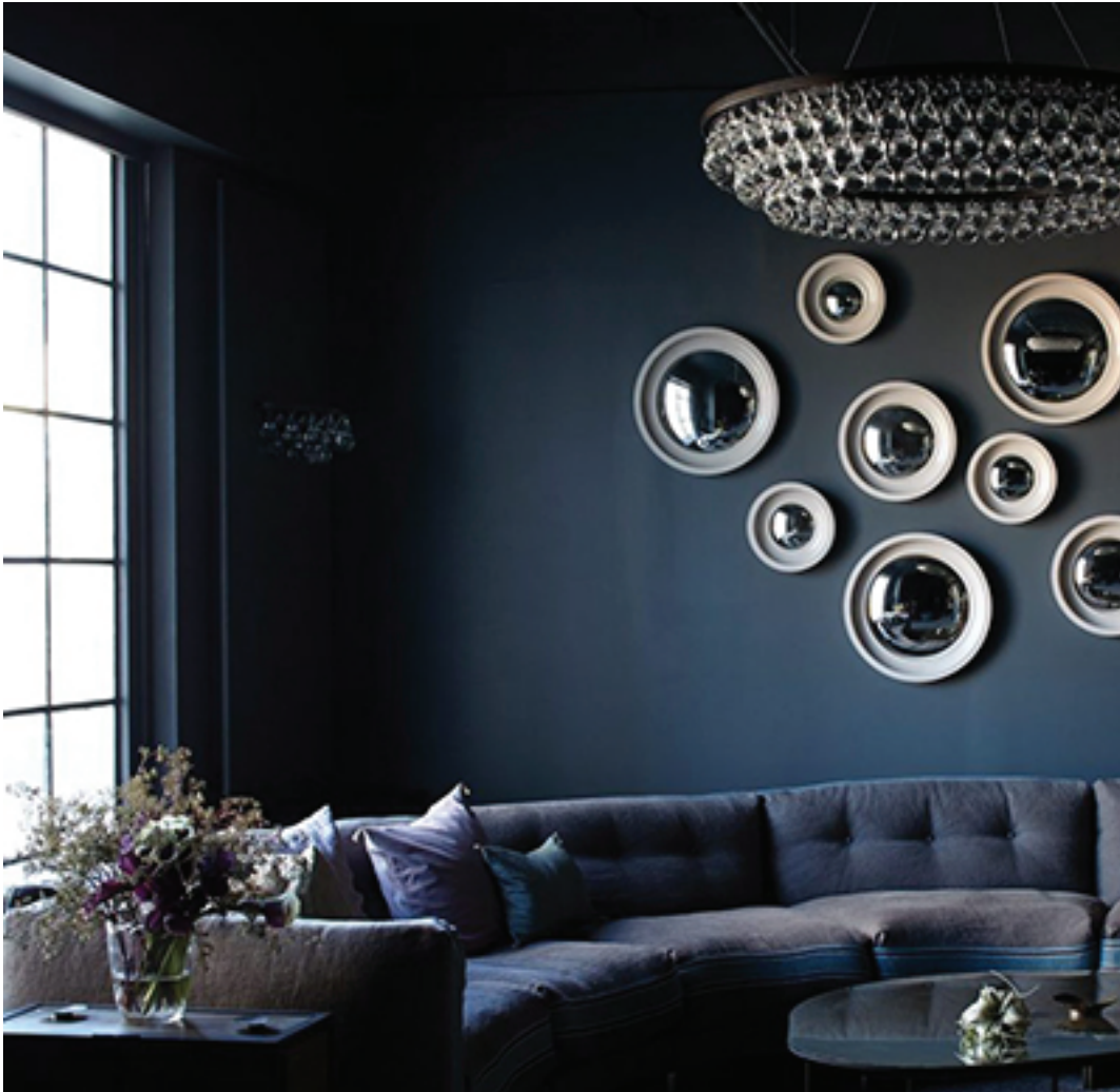
Arctic Pear Chandelier Large by Ochre Contemporary United States

Patinated bronze or polished nickel frame with solid clear glass drops, 3 tiers. 4 tiers available.