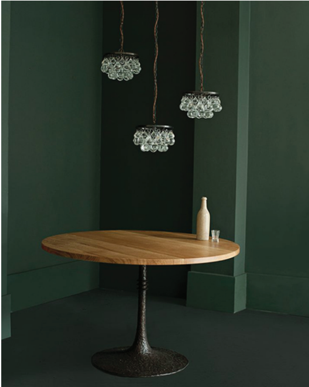
Artic Pear Pendant by Ochre Contemporary United States

Patinated bronze or polished nickel frame with solid clear glass drops, 2 tiers.