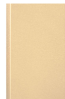
NRB: Natural Rubbed Bronze