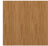
RWO-N: Rift White Oak, Natural