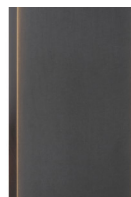
DRB: Dark Rubbed Bronze