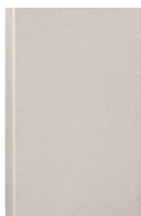
SS4: Brushed Stainless Steel