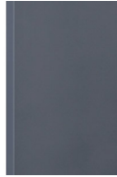
MOC: Matte Opaque Charcoal