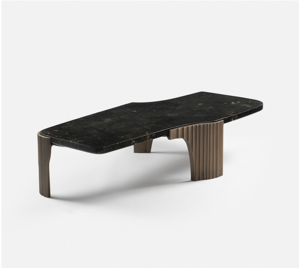
Shown in Natural Bronze with a custom Cast Mineral top