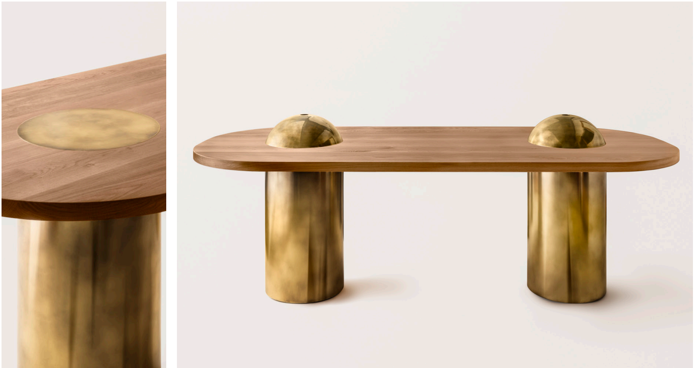
Shown Above in Natural Oak.