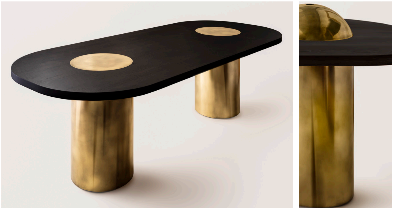
Shown Above in Ebonized Walnut.