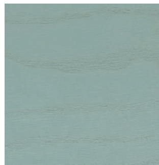
Horizon Blue Ash A-HB