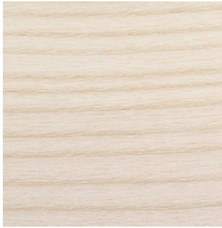
White Ash A-BL