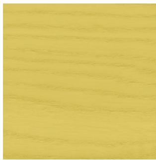
Sun Yellow Ash A-SY