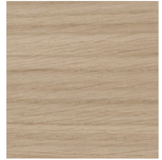
Oak Raw Effect O-RE