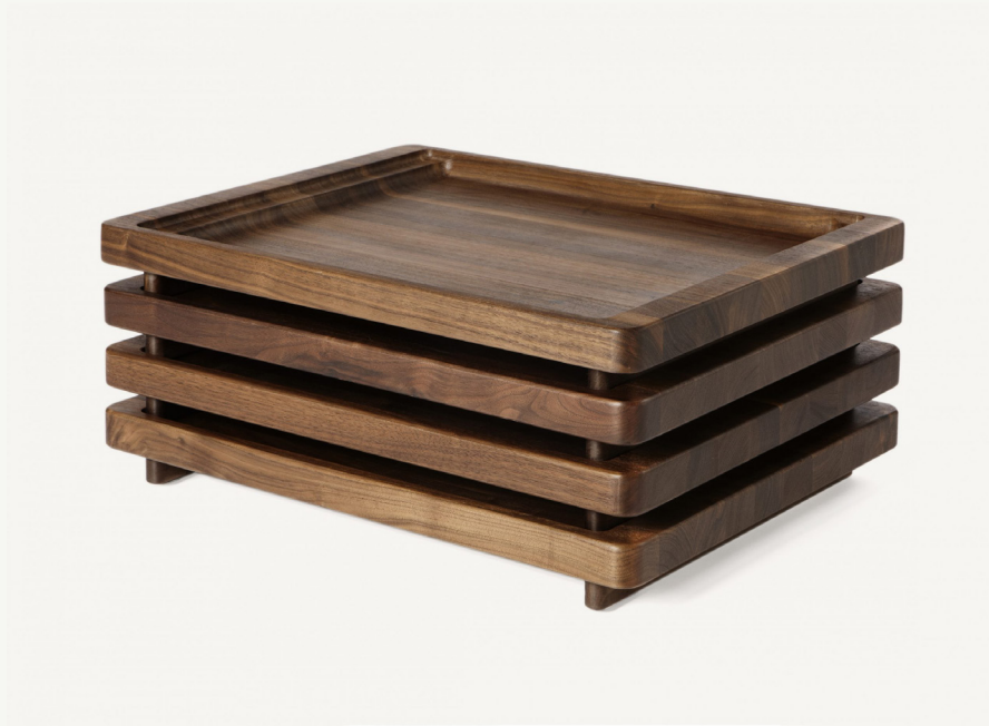
CB-12 Stacking Tray