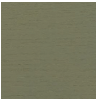
Sage Green Ash A-SG