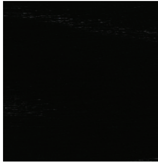
Ebonized Ash A-EB