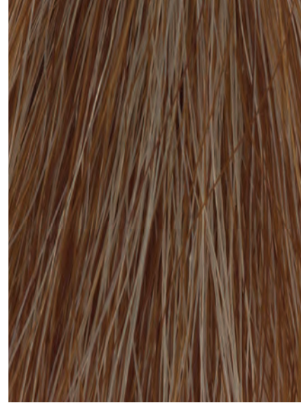
Flaxen Sorrel Horsehair