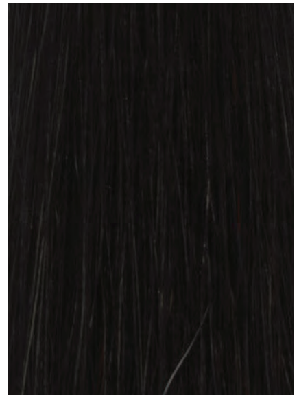
Jet Black Horsehair