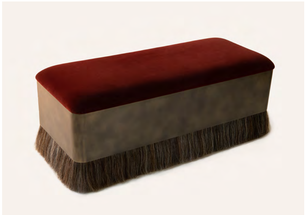
Shown Above: Rectangle