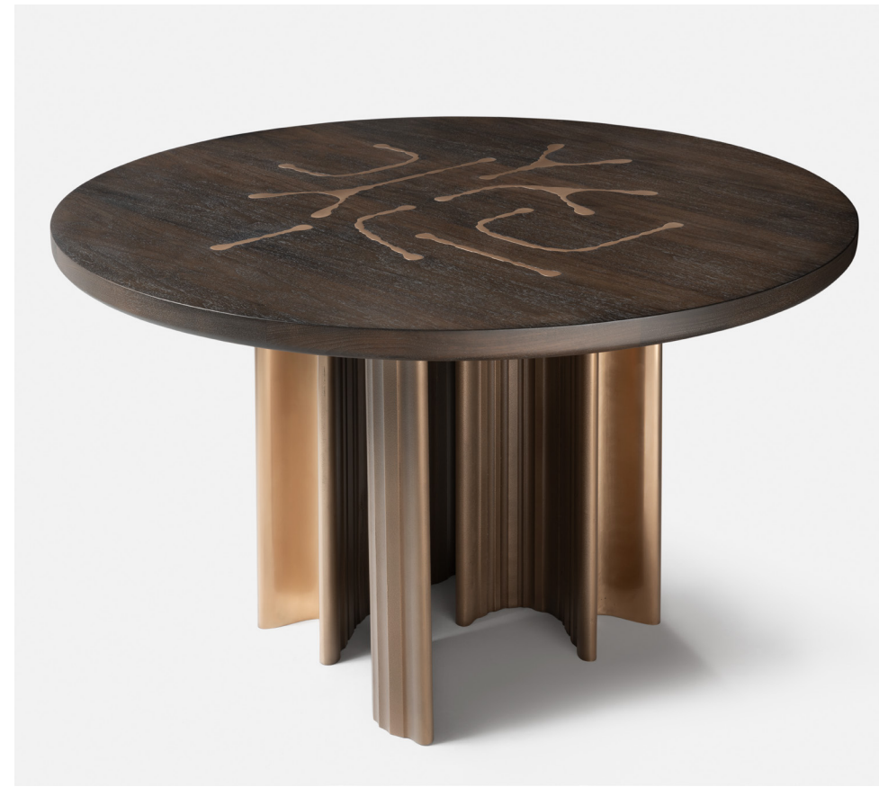
Shown in Natural Bronze and Clove Walnut with Burnished Inlay Shown with custom 52" diameter top