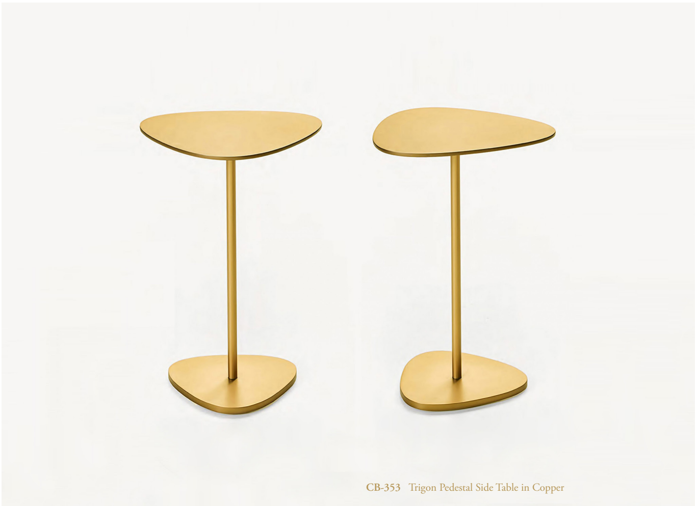
CB-353 Trigon Pedestal Side Table in Copper