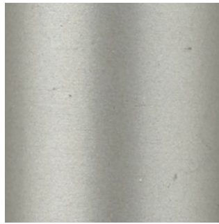
Satin Nickel SN