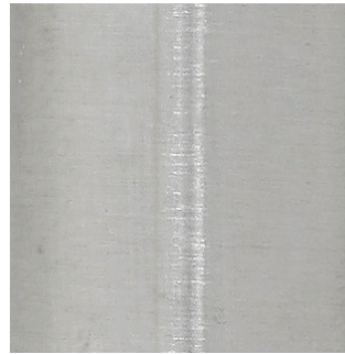
Stainless Steel SS

Nanoceramic coated steel is a more durable and environmentally improved alternative to traditional metal plating where nano particles of metal are mixed with resin and sprayed onto the metal surface versus being placed in a chemical bath .