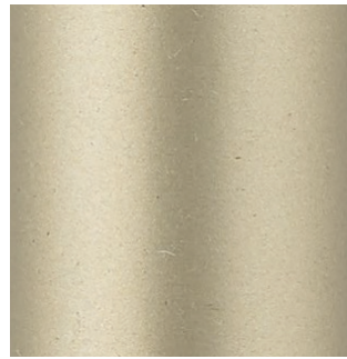
Satin Brass SB