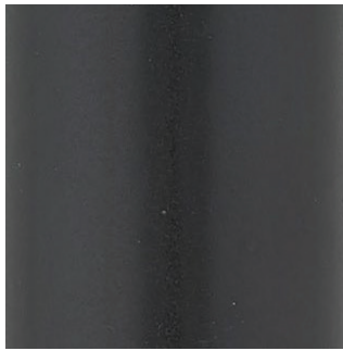
Matte Black BP