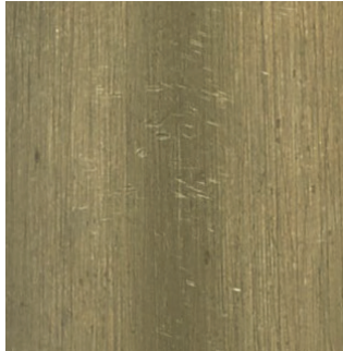
Oxidized Brass BR