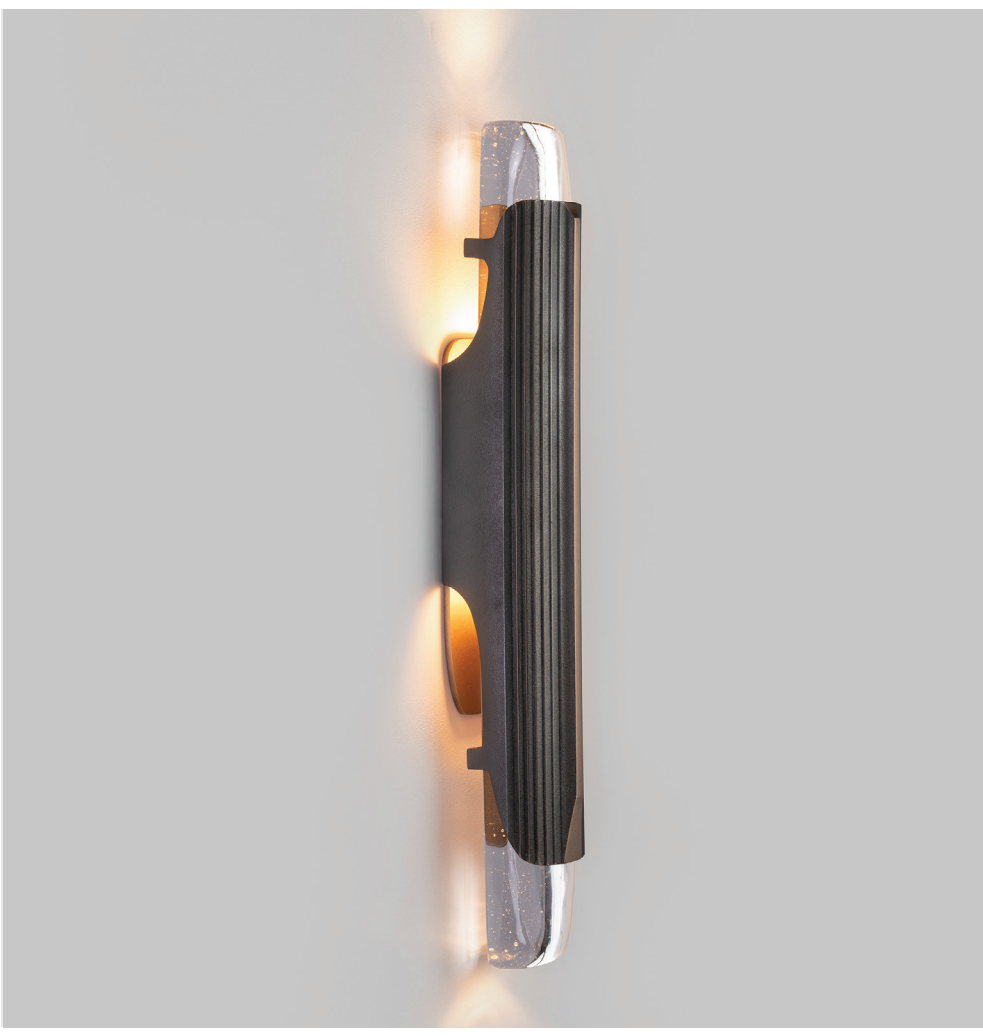
Shown in Silver Dollar Bronze and Clear Glass