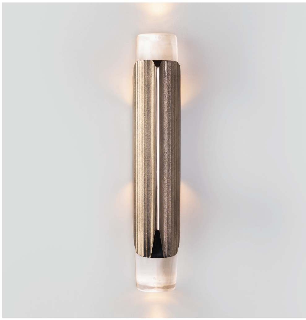
Shown in Polished Bronze and Clear Glass