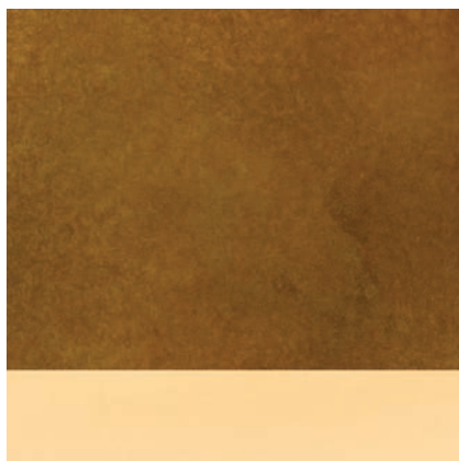
Hand-Patina Bronze with Polished Bronze Shelf