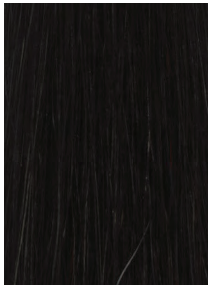
Jet Black Horsehair