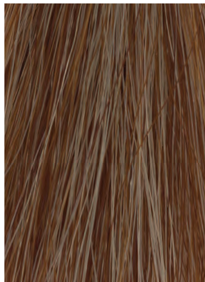
Flaxen Sorrel Horsehair