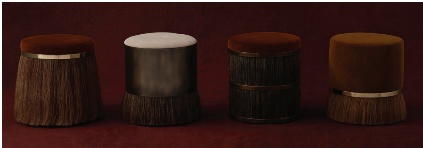
Shown Above: Thing 1 Stool, Thing 4 Stool, Thing 2 Stool, and Thing 3 Stool.