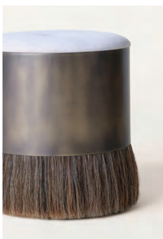
Thing 4 Stool