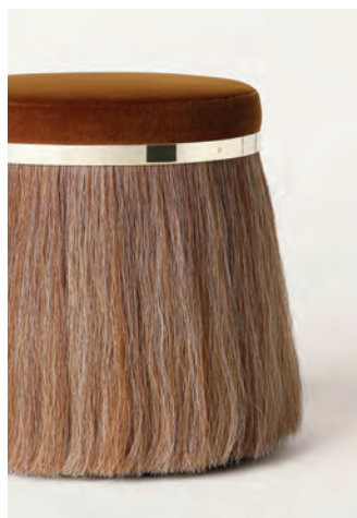
Thing 1 Stool