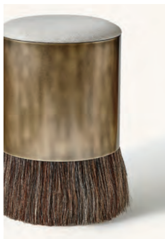
Thing 4 Counter Height Stool