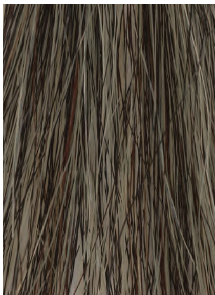
Medium Silver Horsehair