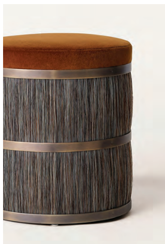
Thing 2 Stool