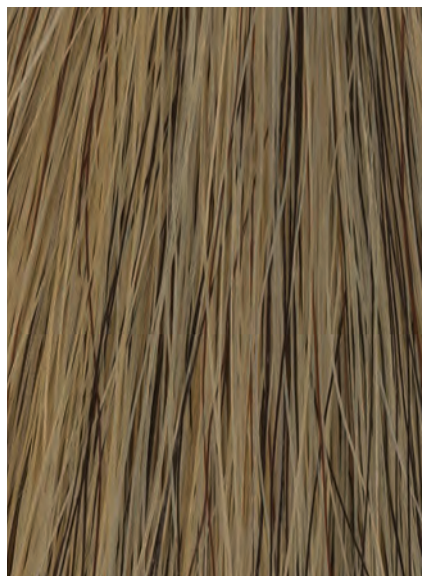
Light Silver Horsehair