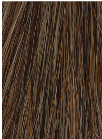
Dark Flaxen Sorrel Horsehair