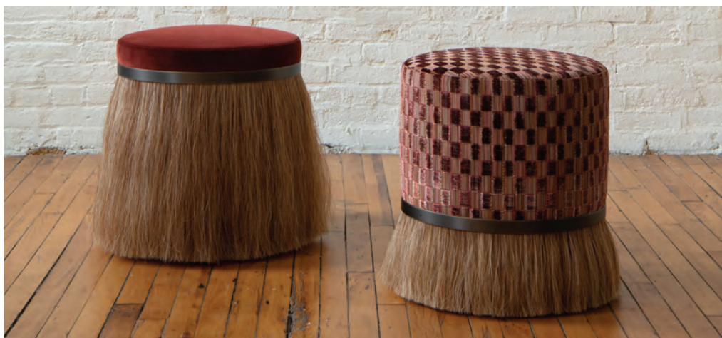
Thing 1 Stool and Thing 3 Stool