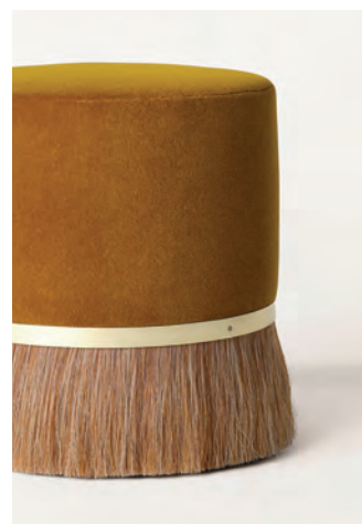
Thing 3 Stool